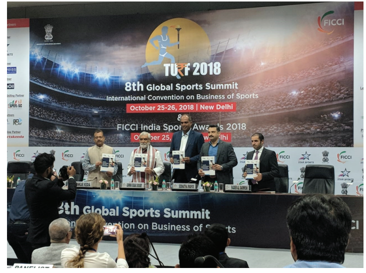
Unveiling of report by Minister of State for Health, Shri Ashwini Kumar Choubey.