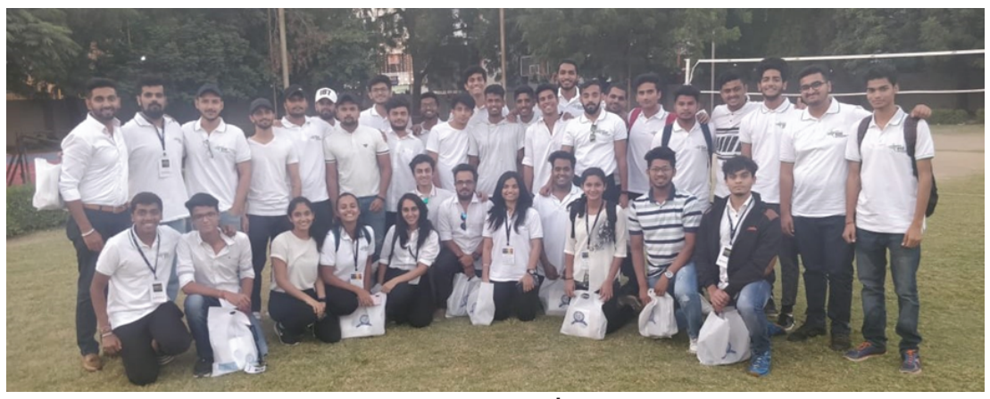
Titanium Jural Fest