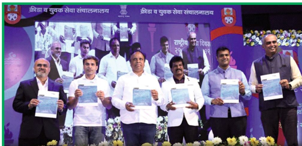
Hon. Minister Ashish Shelar launches IISM's report on Sports Infrastructure in India